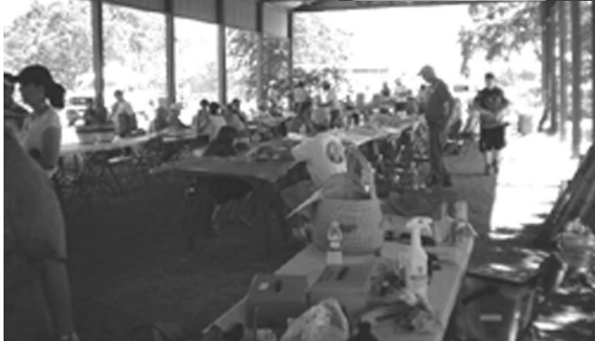
Food, and Shade and Wonderful Prizes!!