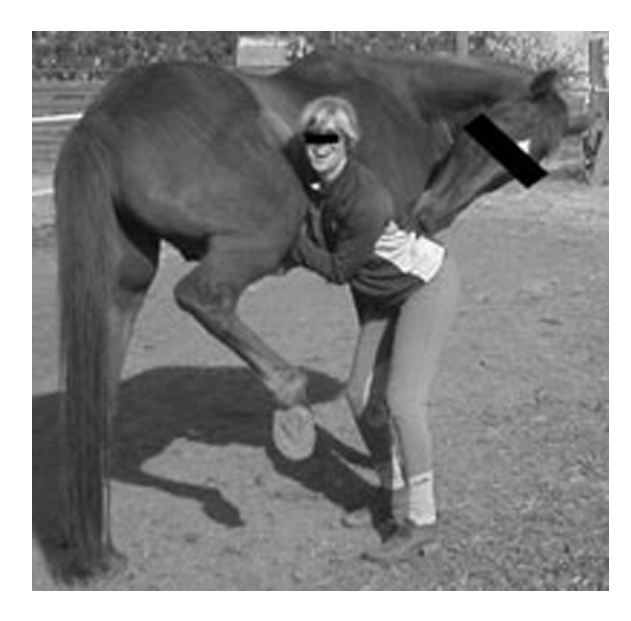
Hey, I can't reach, can you get that for me?

Open Space Got newsletter and dates of events.